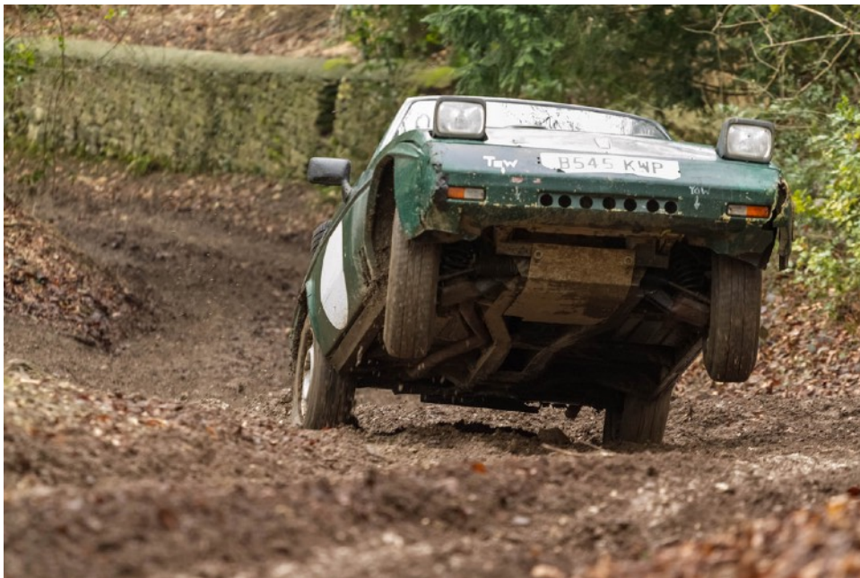
Last year's winner - Aaron Haizelden